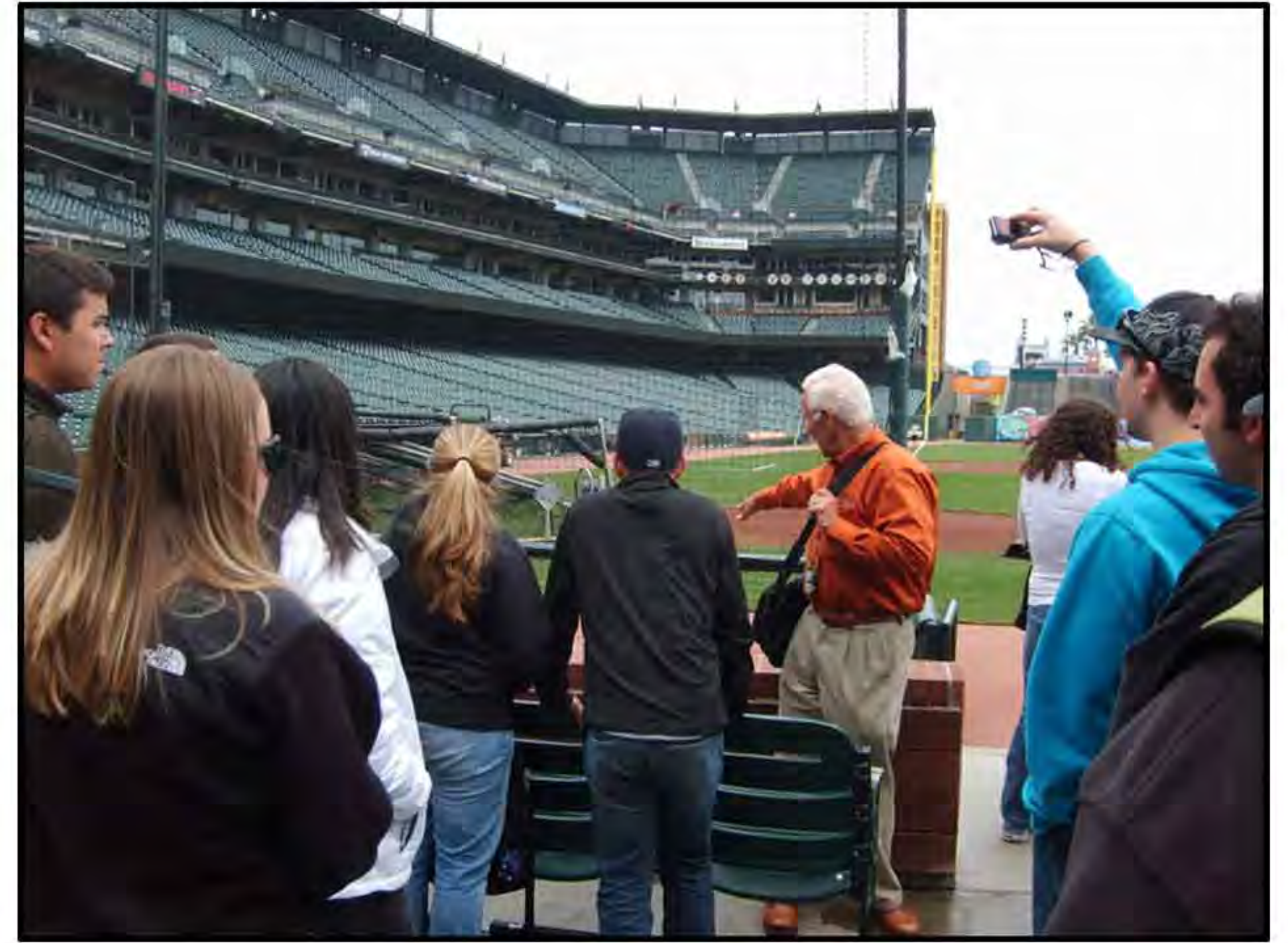
SCE at AT&T Park in San Francisco, May 2010

Last spring, members attended a geotechnical and structural analysis tour of AT&T Park, the home of the San Francisco Giants baseball team. This was a fantastic learning experience for all who attended.